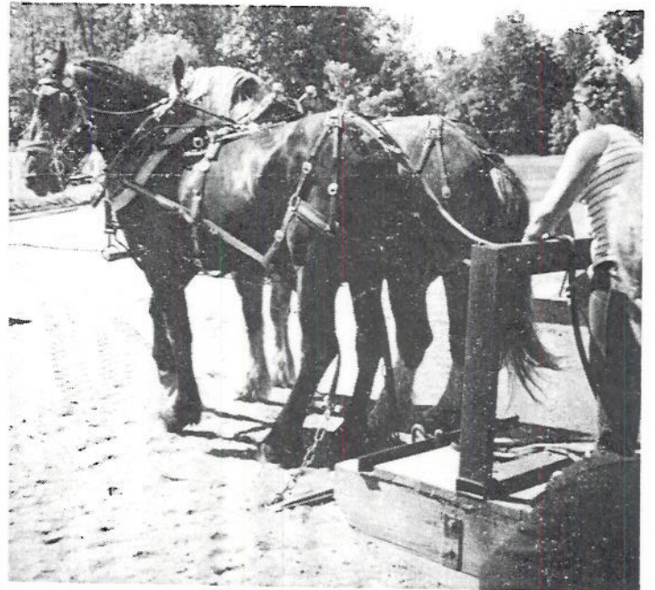
Cathy's sled weighs about 800 lbs.